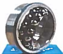
1211 ETN9 BEARING