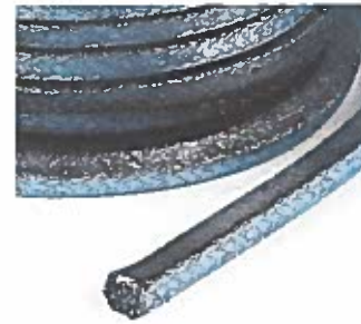
GRAPHITE PACKING SEAL