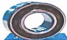
BEARING 3211 ATN9