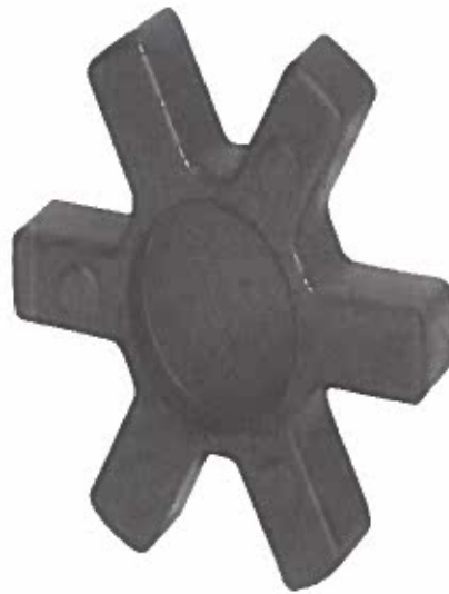
RUBBER LOVE JOY