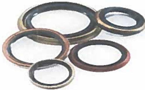
OIL SEAL CR-13569