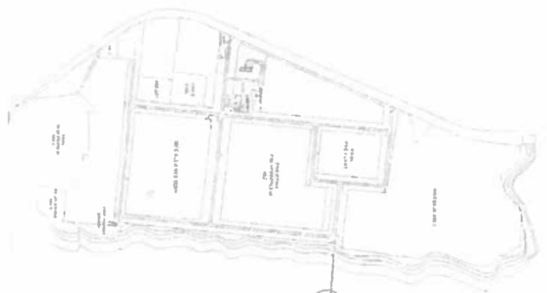
FIRE ENGINE NO. 3 @ JETTY PER PUMP HOUSE