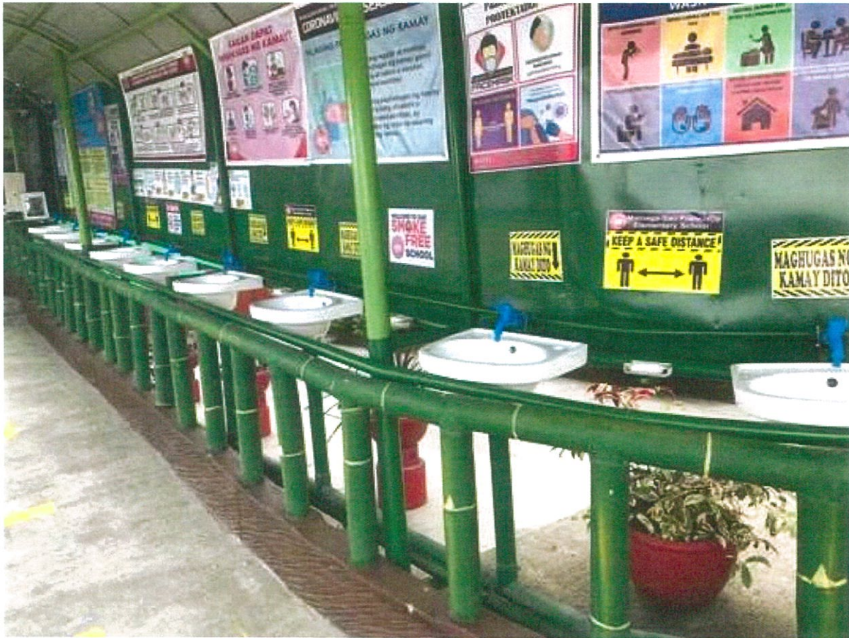
Handwashing facilities for school children of Mainaga-San Francisco Elementary School